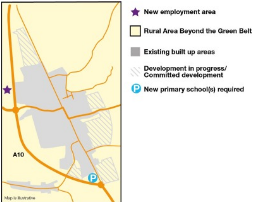
Figure 6.1 Key Diagram for Buntingford

6.2.1 The main features of the policy approach to development in Buntingford are shown on Figure 6.1 below: